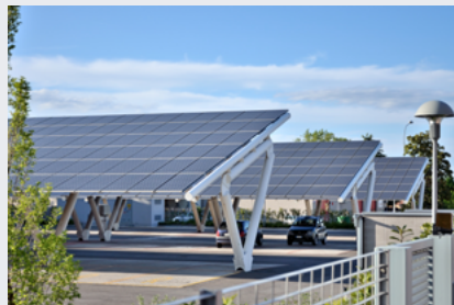
Parking Canopy System