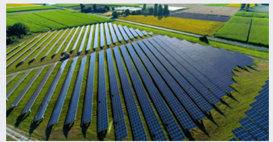
Ground Array System