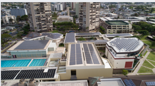
Roof Mounted System

APPI Energy performs an on-site assessment and viability study, both at no cost to the customer. Contact APPI Energy to determine your cost reduction opportunity today.