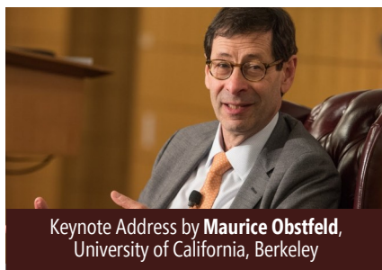
Keynote Address by Maurice Obstfeld , University of California, Berkeley