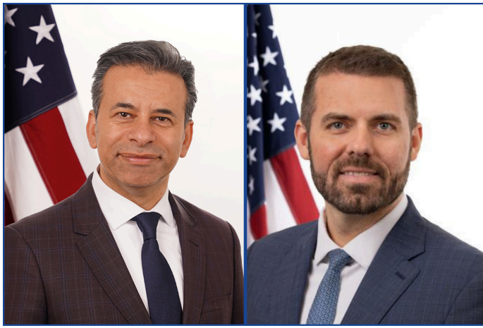
Pictured left to right: Former FDA Commissioner Dr. Marty Makary, Acting FDA Commissioner Kyle Diamantas