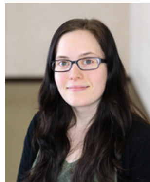
2020 Scholarship Winners