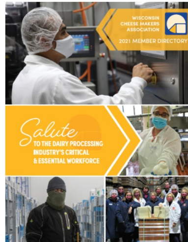
Pictured above: 2021 WCMA Member Directory

WCMA encourages members to consider submitting images and stories that reflect the diversity of their operations. Please submit images of the highest available resolution.