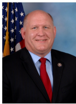
Congressman G.T. Thompson

voices heard on the 2023 Farm Bill, alongside WCMA staff, at a Congressional listening session set for Wednesday, August 16 at 1:00 p.m. (CT) at the Radisson Center in La Crosse, Wisconsin. Congressman Derrick Van Orden (R-WI 03) will host House Agriculture Committee Chairman Glenn “G.T.” Thompson (R-PA 15) for this special event. WCMA will speak in favor of Dairy Business Innovation Initiative funding and our federal policy priorities.