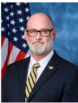
Congressman Derrick Van Orden