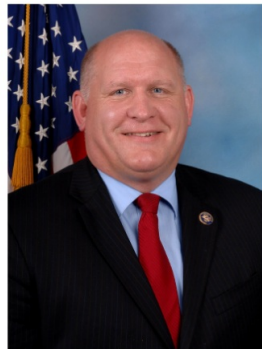
Congressman G.T. Thompson

WCMA members are invited to make their voices heard on the 2023 Farm Bill, alongside WCMA staff, at a Congressional listening session set for Wednesday, August 16 at 1:00 p.m. (CT) at the Radisson Center in La Crosse, Wisconsin. Congressman Derrick Van Orden (R-WI 03) will host House Agriculture Committee Chairman Glenn “G.T.” Thompson (R-PA 15) for this special event. WCMA will speak in favor of Dairy Business Innovation Initiative funding and our federal policy priorities.