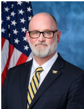
Congressman Derrick Van Orden