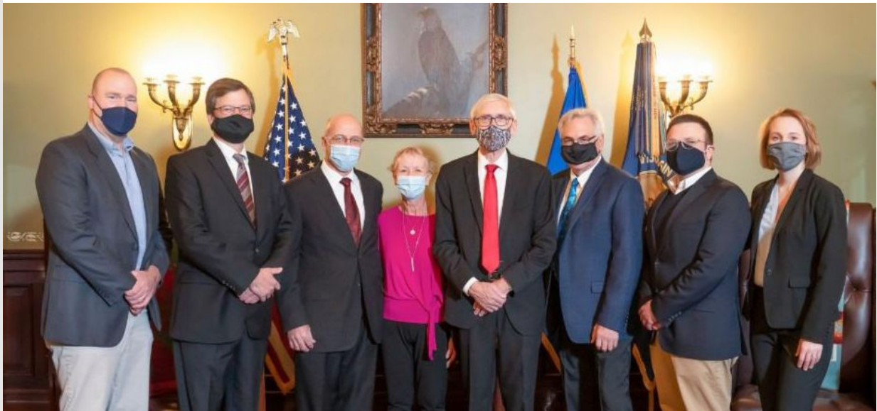
WCMA members and staff join Governor Tony Evers (center right) at the enactment of the Wisconsin Initiative for Agricultural Exports in 2021.

Wisconsin dairy manufacturers and processors engaged in exporting can apply now for International Market Access Grants from the Wisconsin Economic Development Corporation (WEDC). Awards of up to $10,000 each, or $25,000 for graduates of WEDC's ExporTech program, are available to new and experienced exporting companies. Wisconsin cost inputs must make up at least 35 percent of the product or service being exported, and grant recipients must agree to match 30 percent of the funds received. Members with questions may contact WEDC staff .