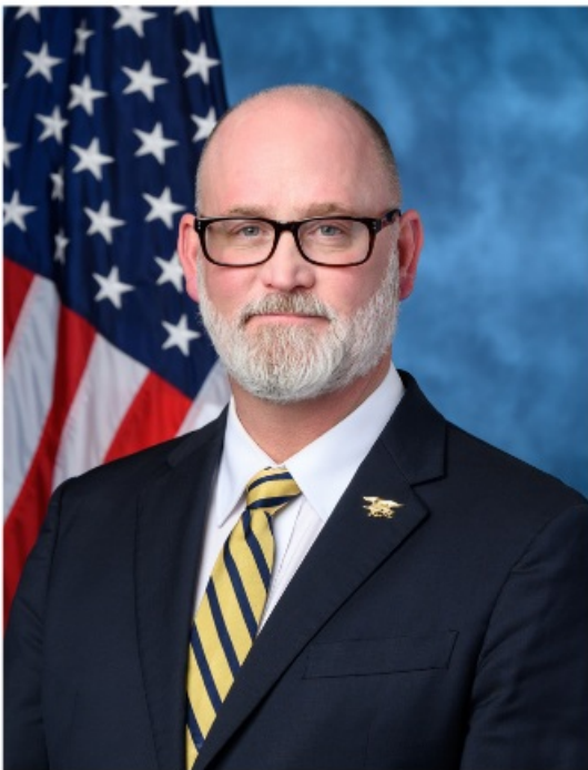
Congressman Derrick Van Orden

WCMA members are invited to make their voices heard on the 2023 Farm Bill, alongside WCMA staff, at a Congressional listening session set for Wednesday, August 16 at 1:00 p.m. (CT) at the La Crosse Center in La Crosse, Wisconsin. Congressman Derrick Van Orden (R-WI 03) will host House Agriculture Committee Chairman Glenn “G.T.” Thompson (R-PA 15) for this special event. WCMA will speak in favor of Dairy Business Innovation Initiative funding and our federal policy priorities.