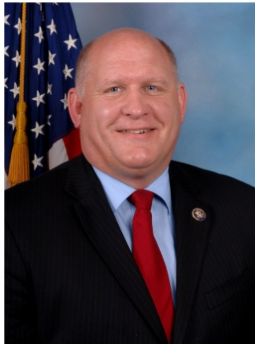
Congressman G.T. Thompson