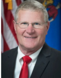
State Sen. Howard Marklein