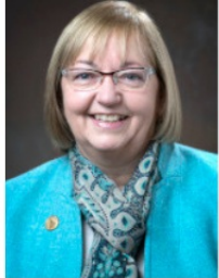
State Sen. Joan Ballweg