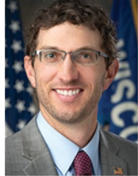
State Rep. Travis Tranel