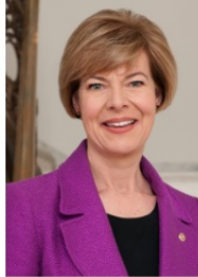
U.S. Senator Tammy Baldwin

Check-in and networking begin at 11:30 a.m., with a catered luncheon served at 12:00 p.m. Here's a look at the meeting program, kicking off at 12:30: