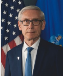
Governor Tony Evers