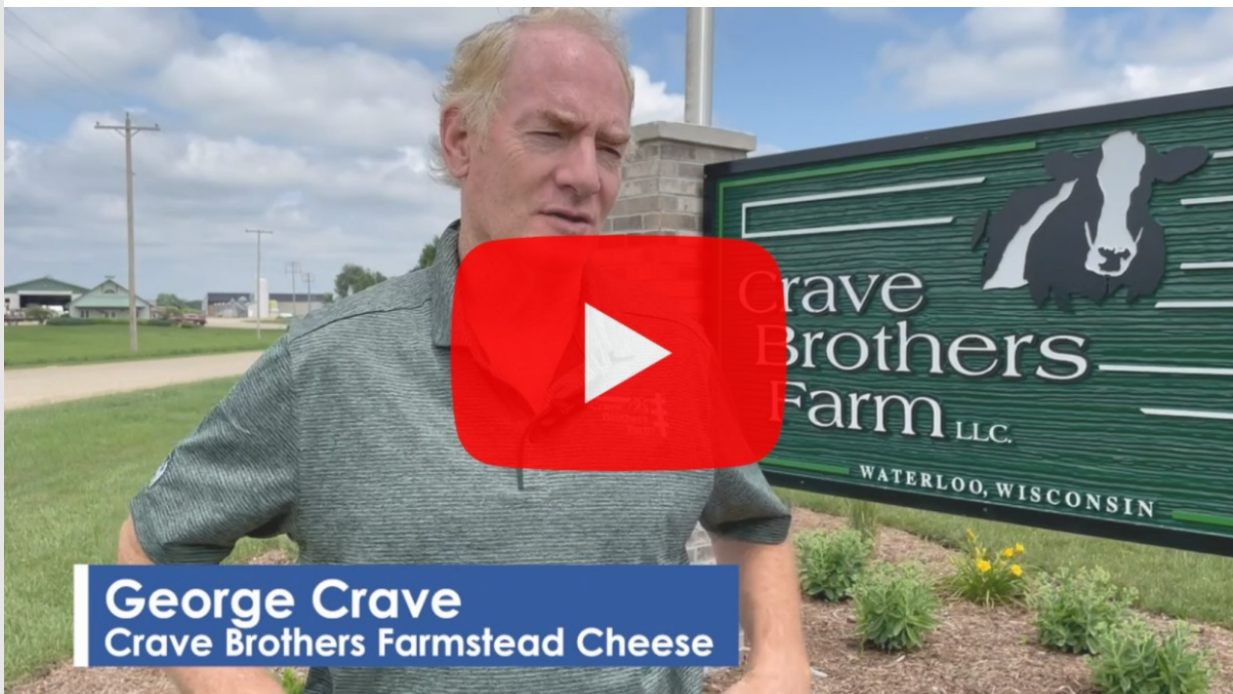
George Crave Crave Brothers Farmstead Cheese