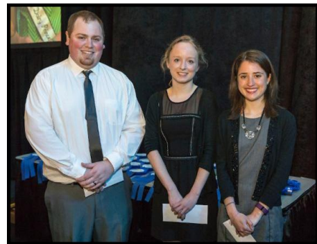
2017 WCMA Scholarship Recipients