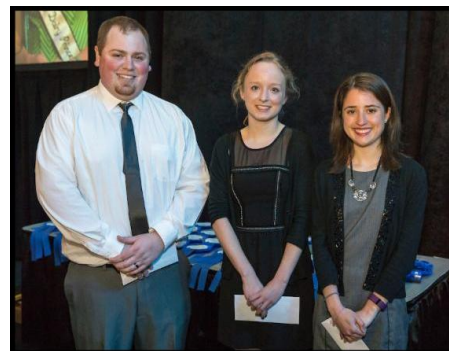
2017 WCMA Scholarship Recipients