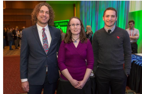
2018 Scholarship Recipients

For complete program details and to download application forms, click here .