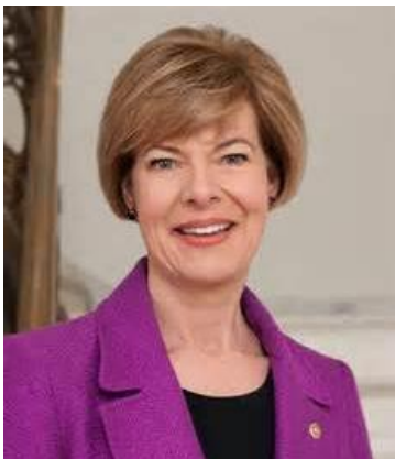
U.S. Sen. Tammy Baldwin