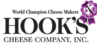
Hook's Cheese Company Mineral Point, Wisconsin