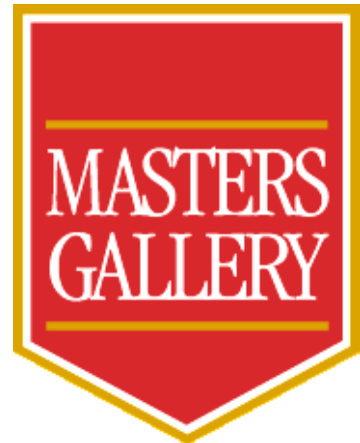
Masters Gallery Foods Plymouth, Wisconsin