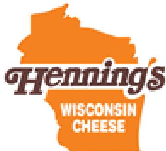
Henning Cheese, Inc. Kiel, Wisconsin