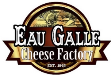
Eau Galle Cheese Factory Durand, Wisconsin