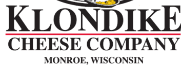
Klondike Cheese Company Monroe, Wisconsin