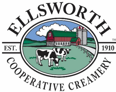
Ellsworth Cooperative Creamery Ellsworth, Wisconsin