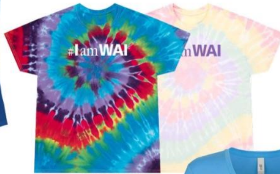
TIE DIE TEE Sizes S-2XL – $25.00