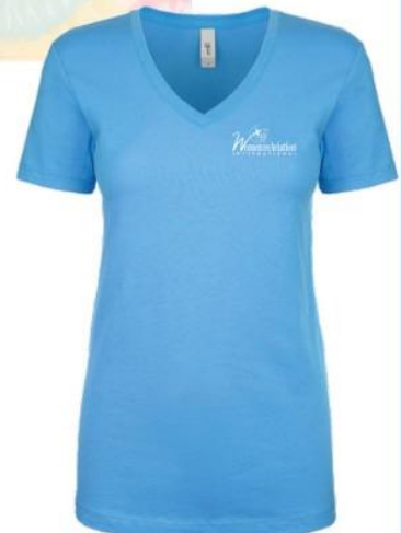
LADIES V-NECK TEE Sizes XS-2X – $22.00