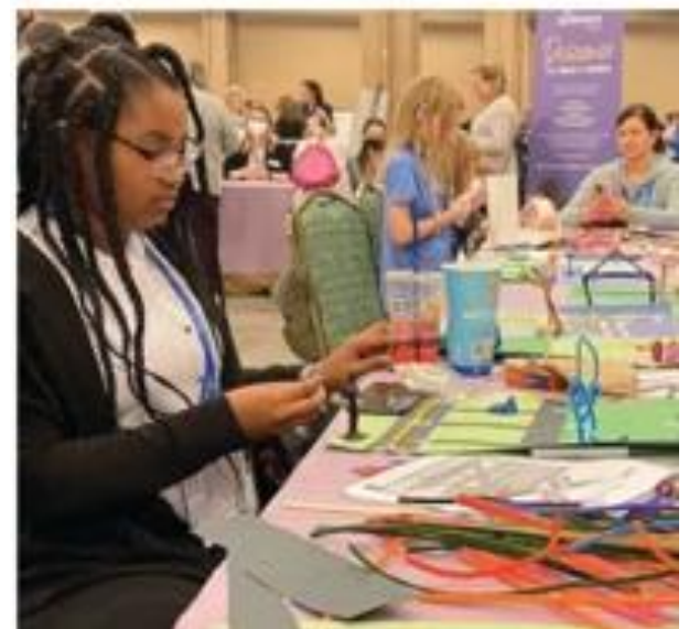
Finalize your plans for the 8th Annual Girls in Aviation Day on September 24, 2022