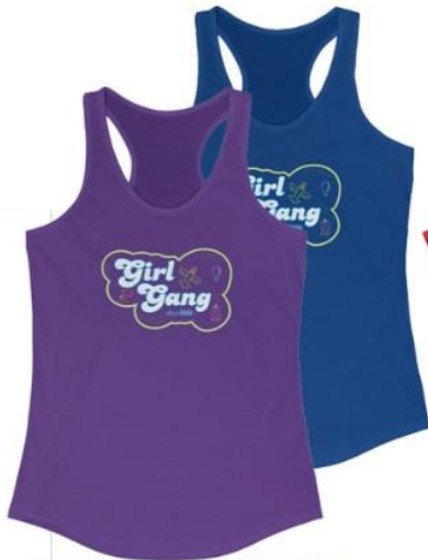
WOMENS RACERBACK TANK Sizes XS-2XL – $22.00