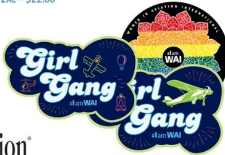
DIE-CUT STICKER Girl Gang: 3" – $2.50/4" – $3.00 Rainbow: 3" – $2.50