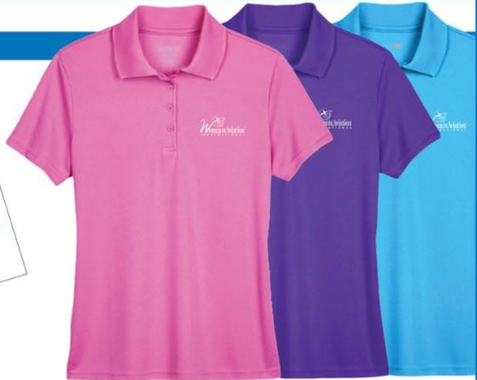
LADIES EMBROIDERED POLO SHIRT Sizes XS-3X – $35.00