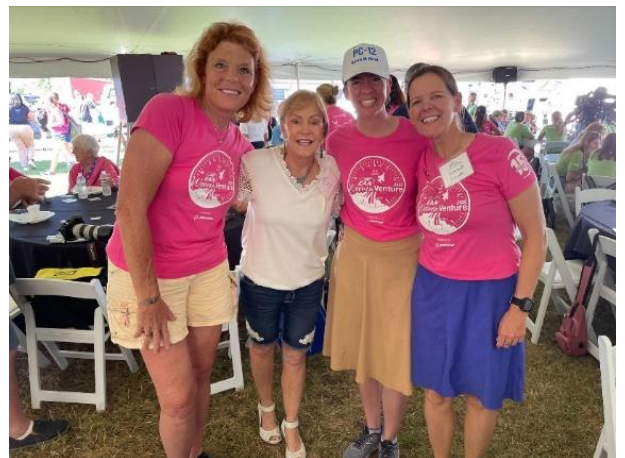
The annual WAI Connect Breakfast kicked off WomenVenture day on Wednesday, July 27.