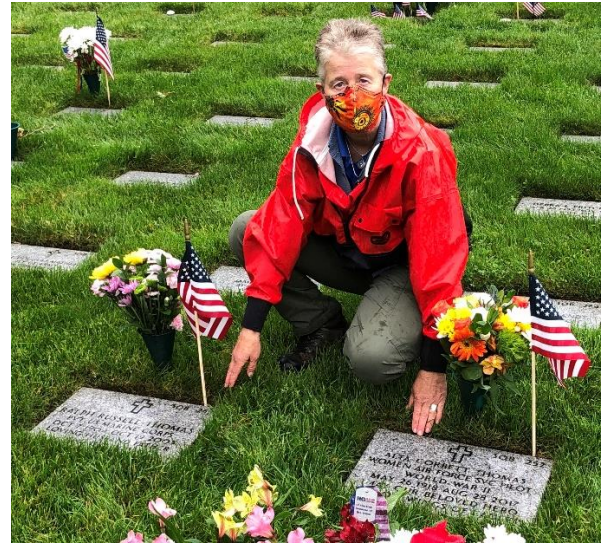
Find WASP graves in your local area and remember their pioneering spirit this Memorial Day weekend.

Thank you for helping WAI remember these brave, pioneering women!