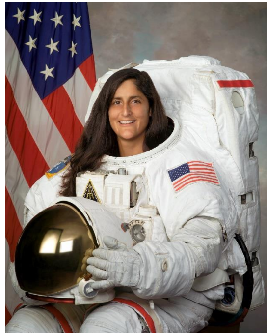
A veteran of NASA space expeditions 14, 15, 32, and 33, Suni is the first person to run a marathon in space on a treadmill.

She is currently training for the first post-certification mission of Boeing's Starliner spacecraft - the second crewed flight for that vehicle - and her third long duration mission aboard the International Space Station. Sunita and her crewmates are working closely with Boeing to develop their spacecraft systems, which will provide roundtrip crew transportation services to the International Space System and along with SpaceX's Crew Dragon, return the ability to launch humans into space from U.S. soil.