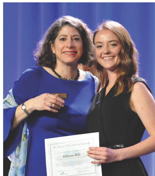
WAI members are encouraged to view the 2021 Spring scholarships open on March 1. Applications are due by May 18, 2021.

With the additional 48 2021 Spring Scholarships, total WAI scholarships awarded this year are valued at $736,805, and nearly $14.1 million since 1995.