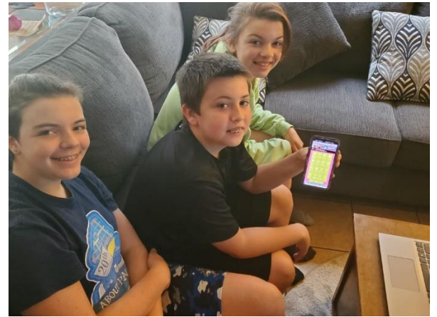
Girls in Aviation Day 2020 became a virtual event with the launch of the new year-round Aviation for Girls App. Available for free for girls (and boys!) ages 8-17, the app is a self-paced learning tool.

We are very grateful to our generous partners for making Girls in Aviation Day 2020 possible! Thank you to Ultimate Partner United States Air Force ; Premier Partners , Amazon, ISTAT Foundation, Piedmont Airlines, PPG Foundation, Sporty's Pilot Shop, Viasat ; Signature Partners , ALPA, AOPA, CAE, NATCA, Pratt & Whitney, Princess Cruises, SkyWest Airlines, Solairus Aviation, The Kroger Company ; Supporting Partners , SpaceX, United Airlines ; and Contributing Partners , Air Transport Services Group (ATSG), ASA (Aviation Supplies & Academics Inc.), Baylor Institute for Air Science, Bose Aviation, Carlsbad Jet Center, Commemorative Air Force, Emanuel Bachman Foundation, Flight Outfitters, Frontier Airlines, Hartzell Propeller, MIAT College of Technology, Redbird Flight Simulations, Sonoma Jet Center, UPS, Wings Financial Credit Union.