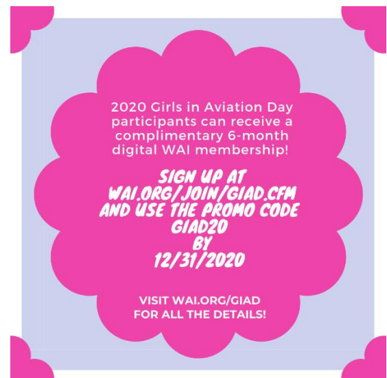
Receive a complimentary 6-month digital WAI membership at wai.org/join/giad.cfm and use the promo code by 12/31/2020.