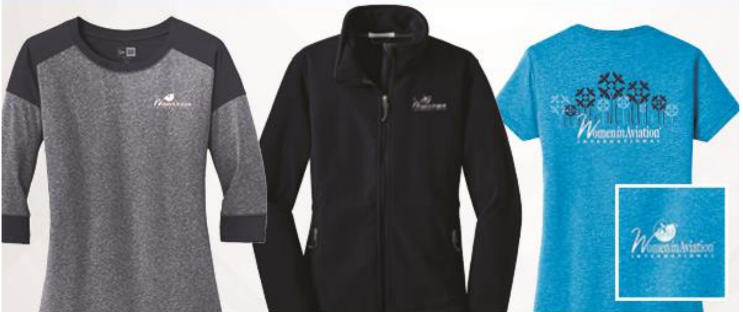
Women's Long Sleeve Shirt $29.95

A portion of all official merchandise goes to supporting your organization!