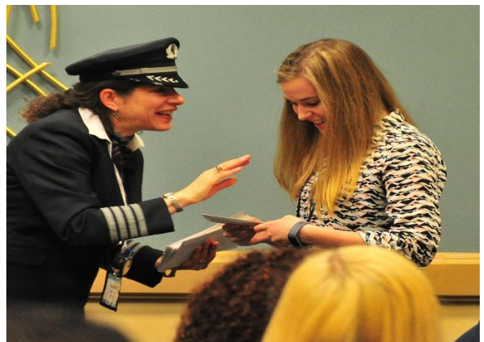
WAI scholarships change lives! Submit your winning application by November 12, 2019.

Scholarship awards are a major benefit of membership in Women in Aviation International and will help you reach your goals and advance in your career. There are more than a hundred scholarships listed for aerospace engineering, aviation maintenance, aviation management, dispatcher, flight training, helicopter, and more. Members in good standing can apply for up to three scholarships, plus a Delta Air Lines - Business Performance Internship. Application deadline is November 12, 2019, for these 2020 scholarship awards.