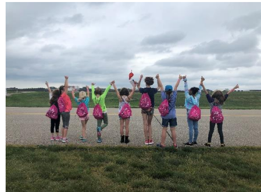
Sporting their #GIAD19 backpacks in Minneapolis, girls showed up in force at the WAI Stars of the North Chapter event.