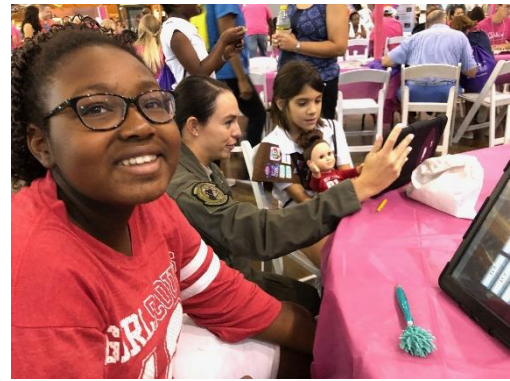
There were smiles all around at the WAI North Texas Chapter Girls in Aviation Day!