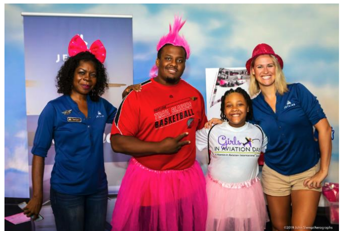
WAI Gone with the Wind Chapter held its Girls in Aviation Day event on September 14, 2019, at the Delta Flight Museum in Atlanta.

More than a hundred Girls in Aviation Day events will be happening on Saturday, October 5, 2019, all around the world. Find an event near you and volunteer or participate. Thanks to our generous partners and chapters, WAI estimates nearly 20,000 girls, ages 8-17, will enjoy a fun and unique #GIAD19 to meet positive role models and learn about all the aviation and aerospace career possibilities.