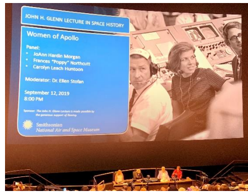
The John H. Glenn Lecture "Women of Apollo" on September 12, 2019, was made possible by the generous support of Boeing.