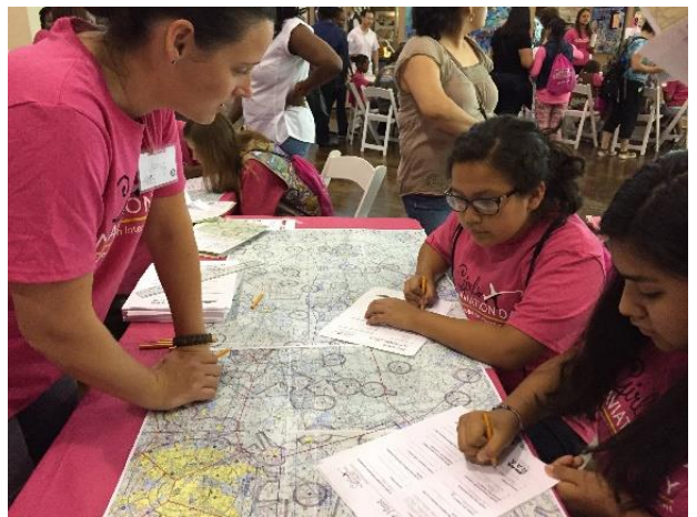
WAI expects 20,000 girls to participate in #GIAD19..