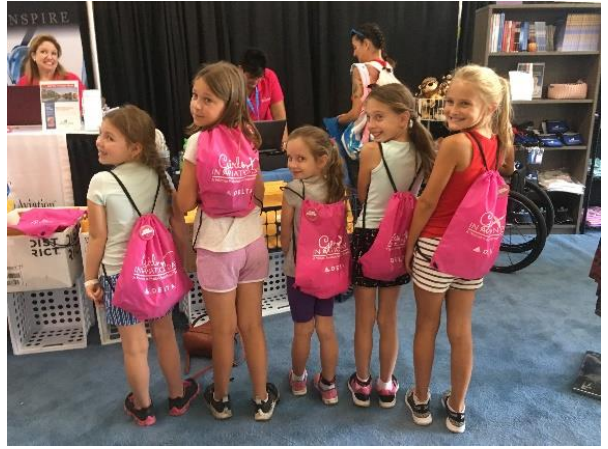
Girls around the world are getting ready for the Fifth International Girls in Aviation Day.