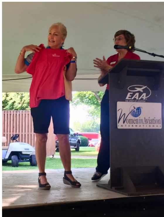
WAI recognizes Julie Clark during EAA AirVenture Oshkosh for her retirement this year from the airshow circuit.