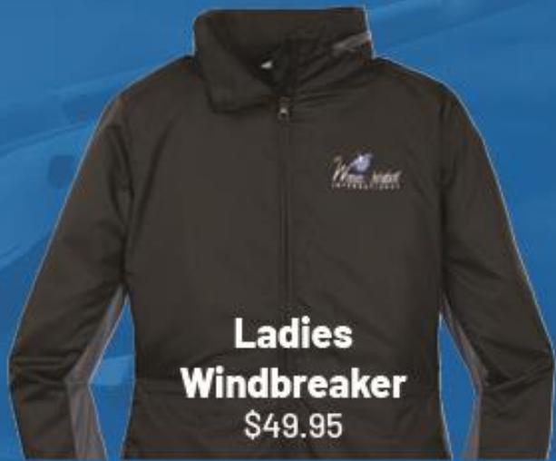
Ladies Windbreaker $49.95

Get Your Official WAI Merchandise at Sporty's!