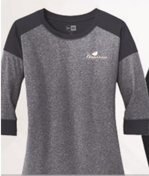
Women's Long Sleeve Shirt $29.95

A portion of all official merchandise goes to supporting your organization!