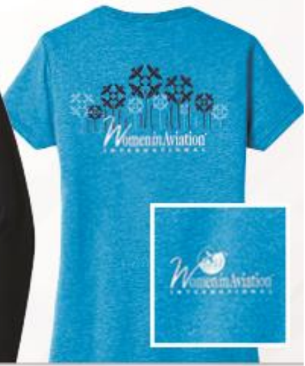
Women's T-Shirt $19.95