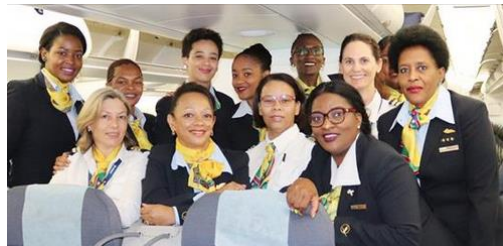
Air Namibia Airbus A330 all-female crew