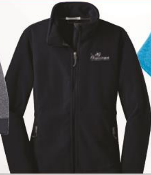
Ladies Fleece Jacket $39.95