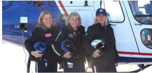
Careflight all-female crew