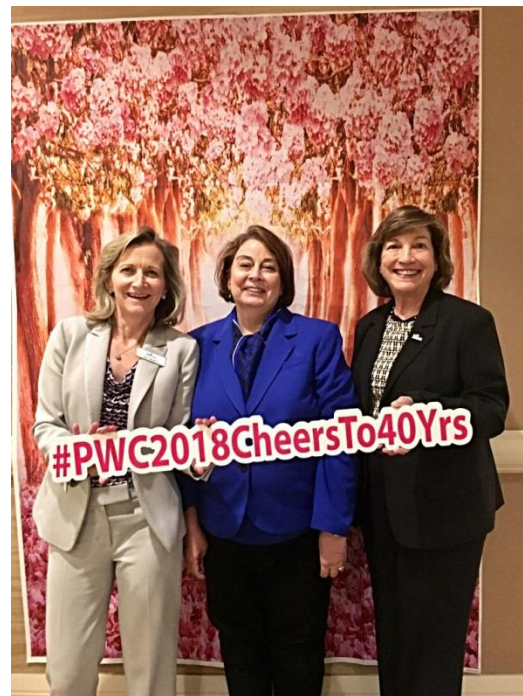
Happy 40th Anniversary PWC from #WomeninAviation!