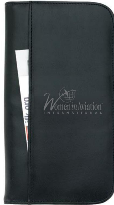
World Travel Wallet featuring the WAI logo