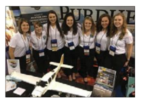
Provide a memorable conference experience to a deserving student