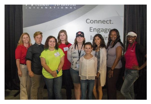
Enjoy lunch with your WAI members and friends during Sun 'n Fun

The annual <u>Sun 'n Fun International Fly-In & Expo</u> will be here before you know it, and WAI will be on site all week April 10-15, 2018, with an exhibit booth in Hangar A (Booth A-056). Don't forget to add the WAI Connect Lunch (sponsored by Mooney and Piedmont Airlines) to your plans on Friday, April 13 at noon at the Buehler Aerospace Skills Center in Lakeland, Florida. WAI members can purchase advance tickets for $18 <u>here</u> (non-members $19) until April 9. Get your tickets early as the price increases on April 10.