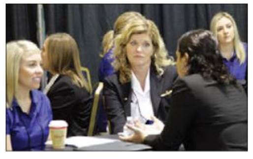
Being a mentor to WAI members helps our growing community

If you have over 35 years of experience in the aviation and/or aerospace industries, we invite you to become a WAI Super Mentor at the WAI 2018 Conference in Reno, Nevada. Your dedicated experience and passionate knowledge of our industry can provide valuable insights to our student members, younger professionals, and anyone who is new to the conference as they rise up through the ranks by learning from those of you have "Been there, done that!" <u>Ready to be a Super Mentor?</u> You can pick up your Super Mentor button to wear at the conference at the information booth or the membership booth.