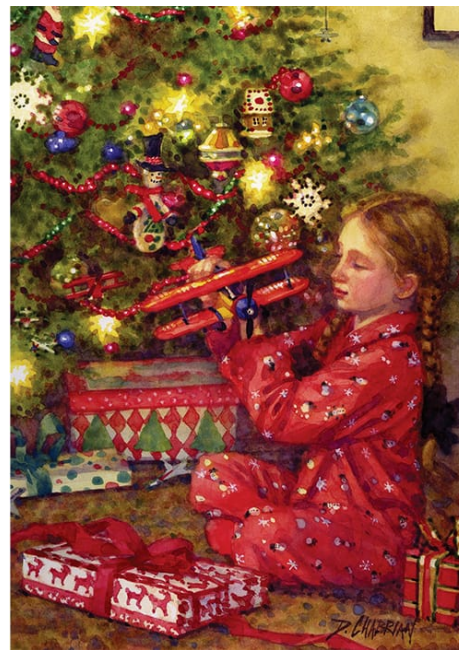
WAI "Holiday Dreams" card