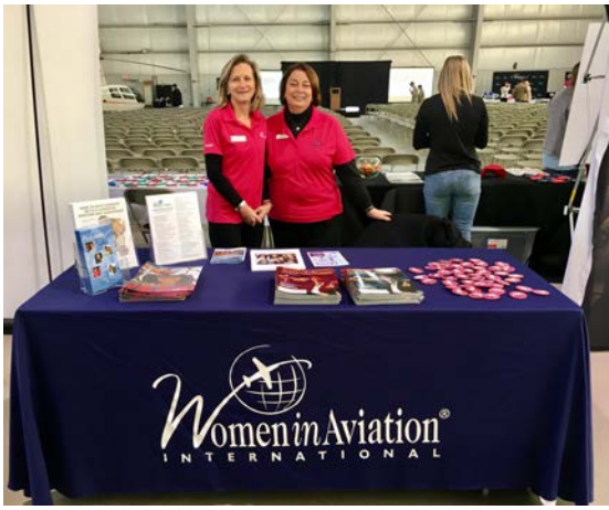
WAI staff is ready to meet high school students at the Aviation Education Expo