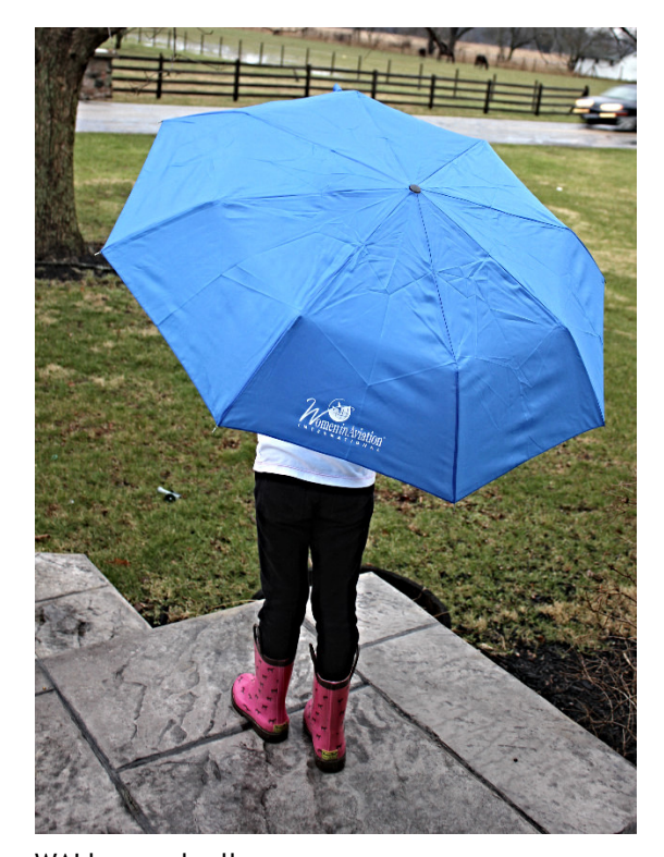
WAI logo umbrella

Colors: Black, Royal Code: 30079 Price: $10.00