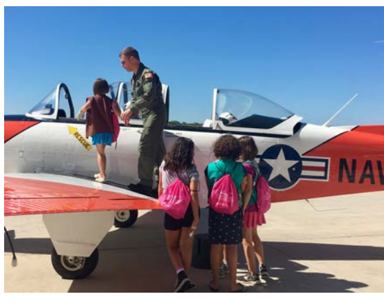
Greater Capital Region Chapter #GIAD17