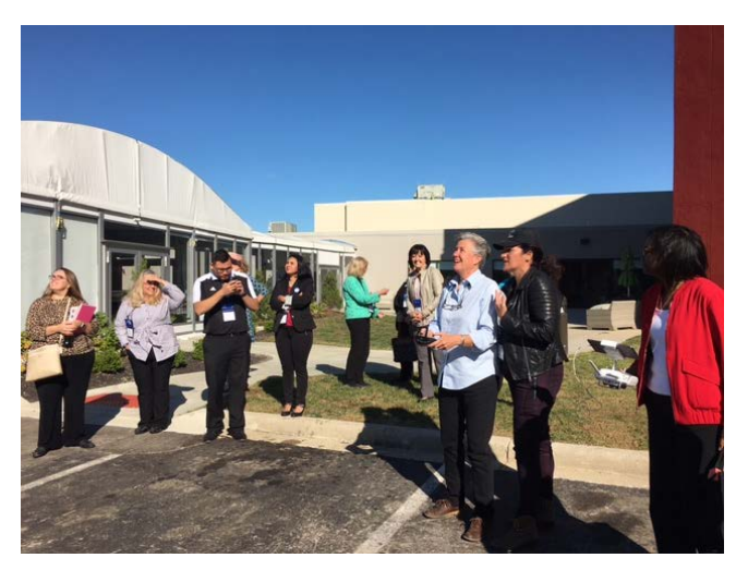
The weather was beautiful for drone demos