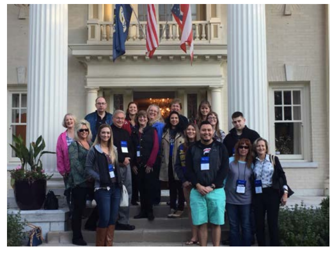
Hawthorn Hill, The Wright Brothers' Family Home