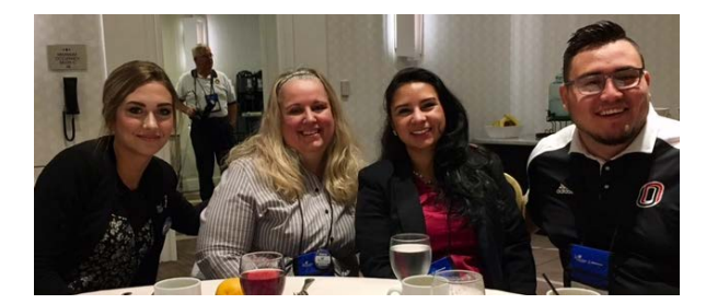
Attendees enjoyed a day of interesting speakers