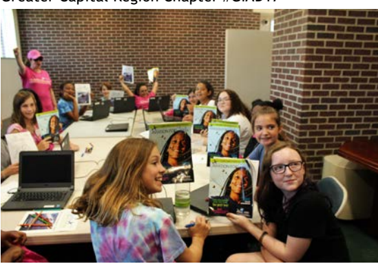
This year's Aviation for Girls magazine was distributed at all Girls in Aviation Day events.

Check WAI social media for coverage of #GIAD17 events around the world. Here's just a few examples: