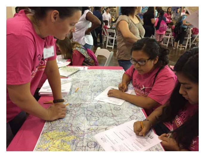
#GIAD17 Dallas Chapter event