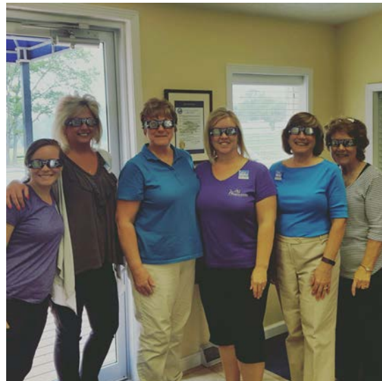
Ready for the 2017 total eclipse in Ohio.

Corporate member Amazon invited staff to its new air cargo hub at Cincinnati/Northern Kentucky International Airport (CVG) that will accommodate its growing fleet of Boeing 767 Prime Air delivery jets.