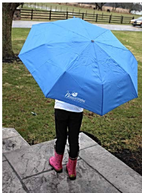
WAI logo umbrella