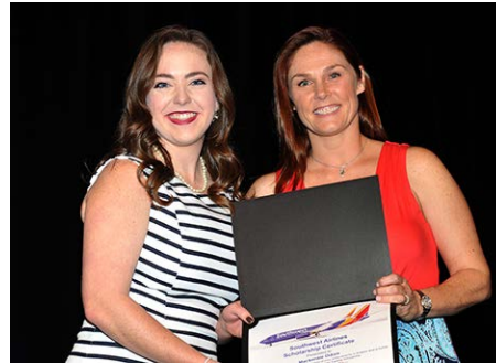
Scholarships are a major membership benefit!

Over 110 scholarships, valued at $632,965, are available for WAI members this year. Any active member by November 1, 2017, can apply for up to three scholarships this year, plus an internship. Newly added are three American Airlines $5,000 educational scholarships. Qualifications and application information are available on the WAI website . Thinking about how to spend your summer of 2018? Delta Air Lines is offering a 13-week internship for students enrolled in a baccalaureate degree in business management or industrial engineering.