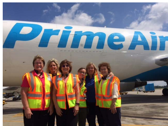
WAI staff toured Amazon's Prime Air sorting facility in Cincinnati.