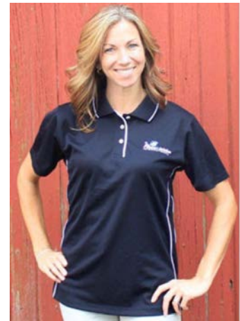
Ladies Dri-Mesh Polo