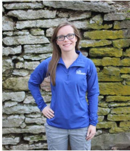
Stretch Pullover with WAI logo