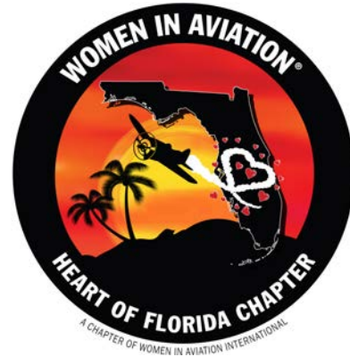
New Heart of Florida Chapter logo

Congratulations to the new Heart of Florida Chapter of Lakeland, Florida, for winning the WAI Chapter Logo Contest by popular vote during the 2017 International Women in Aviation Conference.