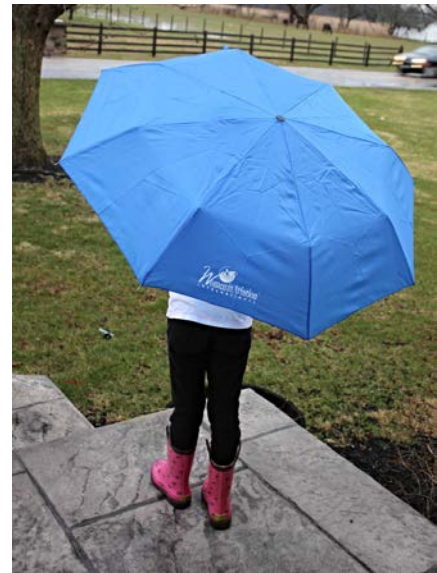
Folding Umbrella with WAI logo