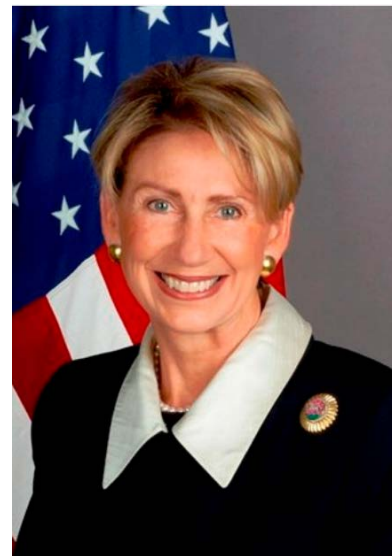
Barbara Barrett, WAI 103

Congratulations to Ambassador Barbara Barrett , WAI 103 and chair of The Aerospace Corporation, for being named the first female recipient at this year's Leadership in the Nation's Interest Award. Barbara will be recognized as an extraordinary business leader in the aerospace industry during the Committee for Economic Development's Spring Policy Conference in Washington, DC, on April 19-20, 2017.