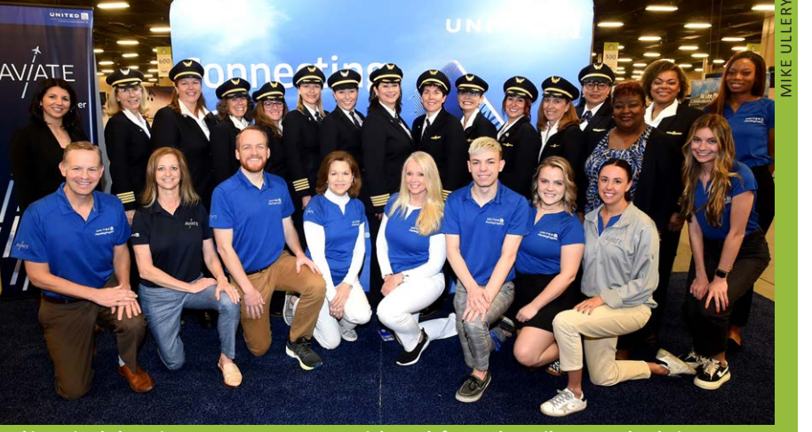
United is excited about its AVIATE program, a straight path for student pilots to make their way to United's cockpits. The company wants to hire 10,000 pilots in the next decade! Find out more at Booth 419.