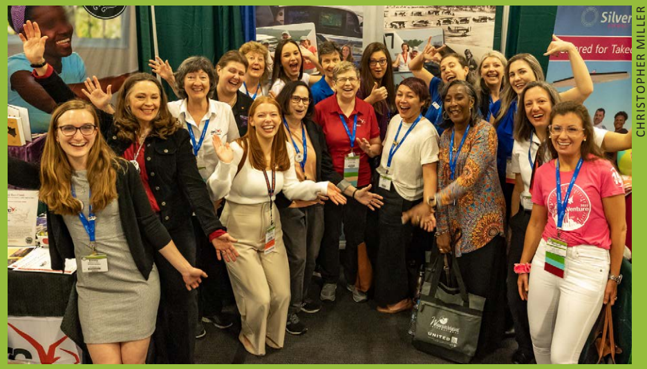
The energy is high at the Air Race Classic Booth 725 in the Ryman exhibit hall. Find out what you need to know about entering one of the longest running general aviation air races (and one built and run by women pilots).