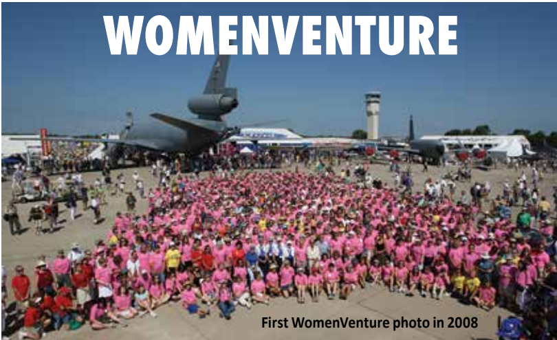
First WomenVenture photo in 2008

Nine years ago the goal was to take a photo of what would be the world's largest gathering of female pilots, and on August 1, 2008, approximately 800 women gathered in pink T-shirts during EAA AirVenture Oshkosh. The celebration of women in aviation at Oshkosh has steadily grown in the years since, and in 2017, women involved in all facets of the aviation community will gather for the tenth annual photo as part of EAA's WomenVenture.