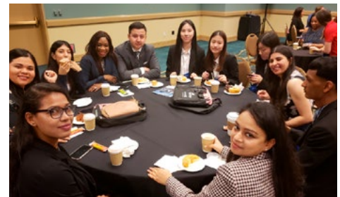
11 Students of Aviation Management from York College, the City University of New York