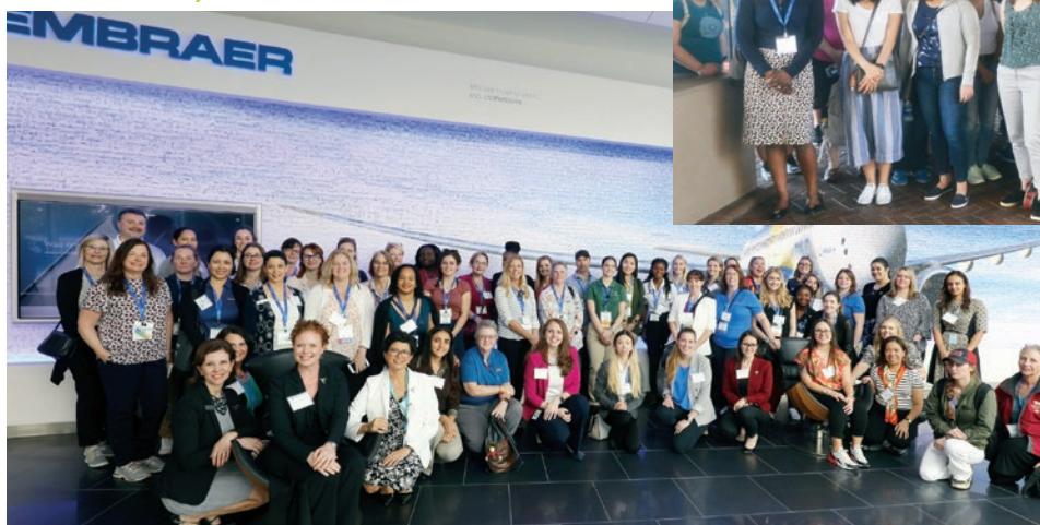
Embraer Facility Tour