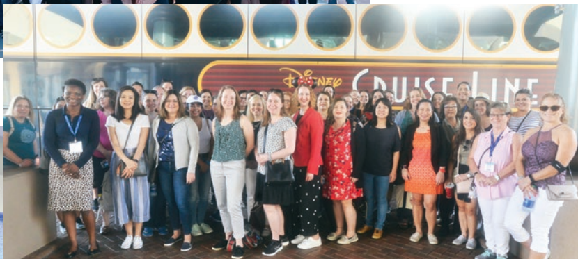
Disney's Business Behind the Magic