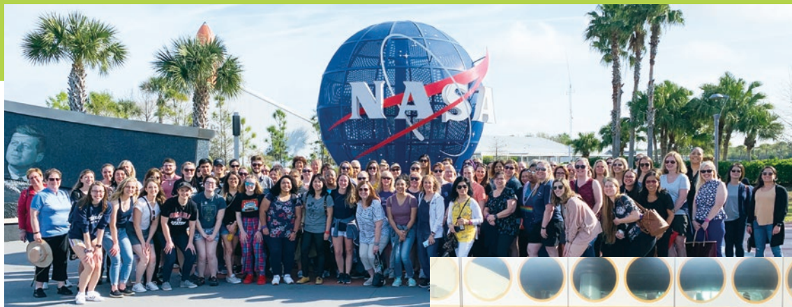
Kennedy Space Center Tour