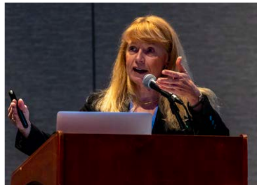
Share your knowledge and expertise with WAI2025 conference attendees during education sessions for a variety of interests.