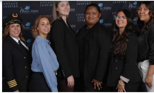
WAI scholarships change lives. Review the WAI2025 scholarship descriptions on line and in Aviation for Women July/August 2024 issue.