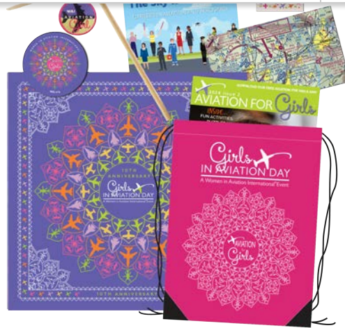
GIRLS IN AVIATION DAY 2024 ACTIVITY KIT

If you have not hosted a GIAD and would like to get involved email GIAD@wai.org for information. WAI staff is here to support you to inspire the future of aviation together.