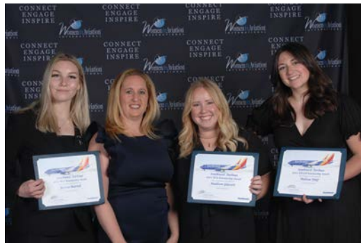
Each WAI member can apply for up to three scholarships for the 2025 awards.