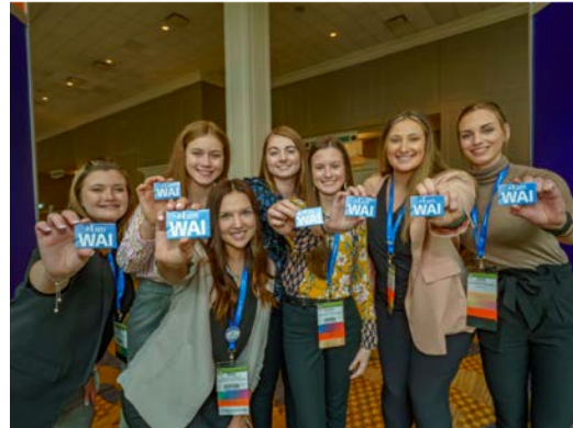
Share your thoughts about your WAI membership experience. The 2024 survey closes July 10.

Your input will be used to develop our resources and benefits to enhance your membership experience.