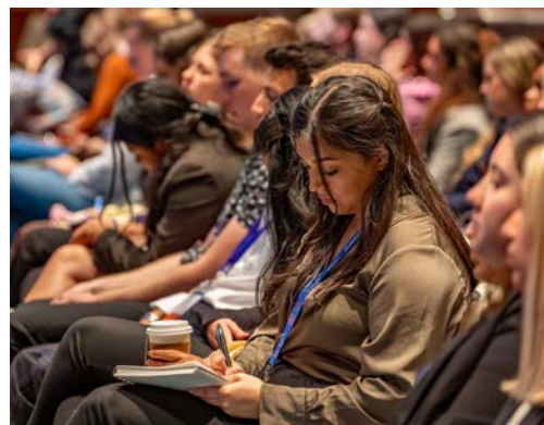
WAI2025 education sessions will offer various learning levels for six different tracks.