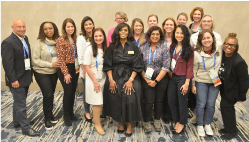
Class of 2024