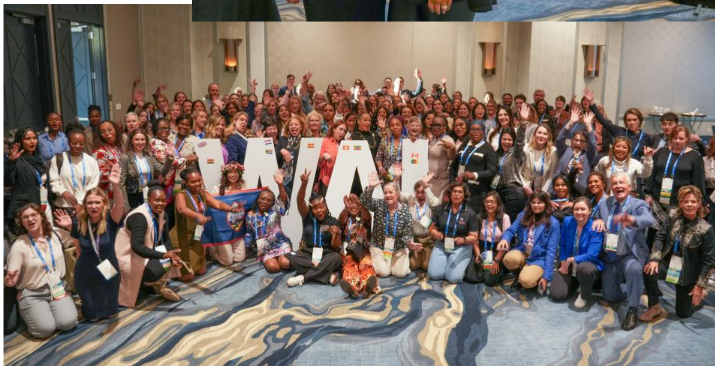
WAI International Members gathered for this annual reception Thursday evening at the conference