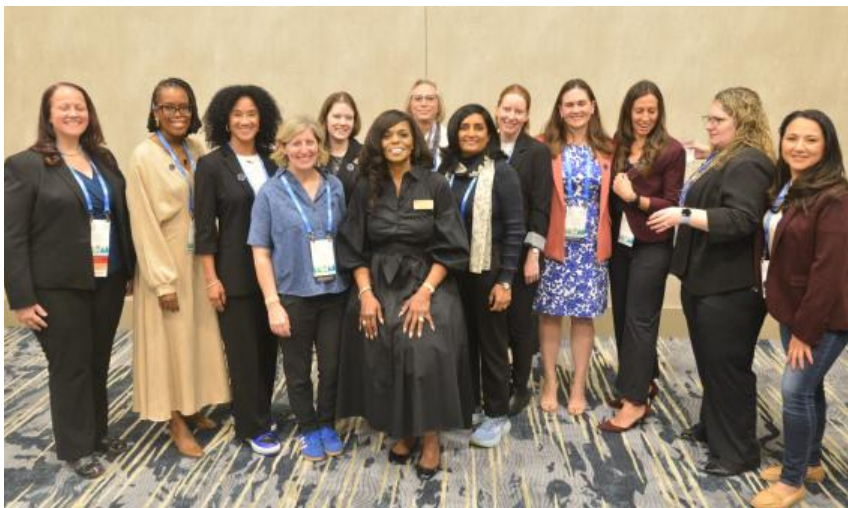
Class of 2025