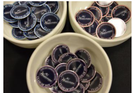
Each Harvard Emerging Leader received a special commemorative class pin.