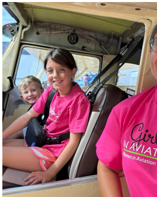
WAI chapters and corporate members celebrated the 10th Annual Girls in Aviation Day on September 21, 2024, around the world.

Watch our GIAD2024 Highlights on Instagram