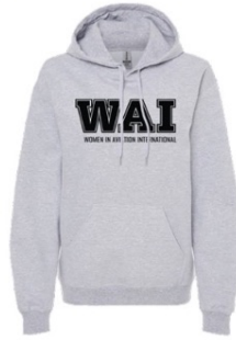
Unisex "WAI Collegiate" Sport Gray Hood Sweatshirt Sizes: S, M, L, XL, 2XL $40