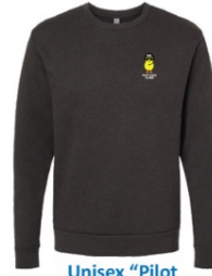
Unisex "Pilot Chick" Charcoal Fleece Crew Sweatshirt Sizes: S, M, L, XL, 2XLL $40