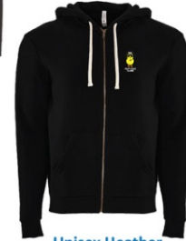
Unisex Heather Black Full Zip Hood Sweat Sizes: XS, S, M, L, XL, 2XL $45