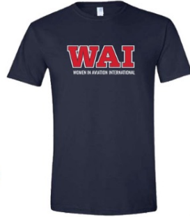
Unisex "WAI Collegiate" Navy Blue Softstyle® T-shirt Sizes: XS, S, M, L, XL, 2XL $24