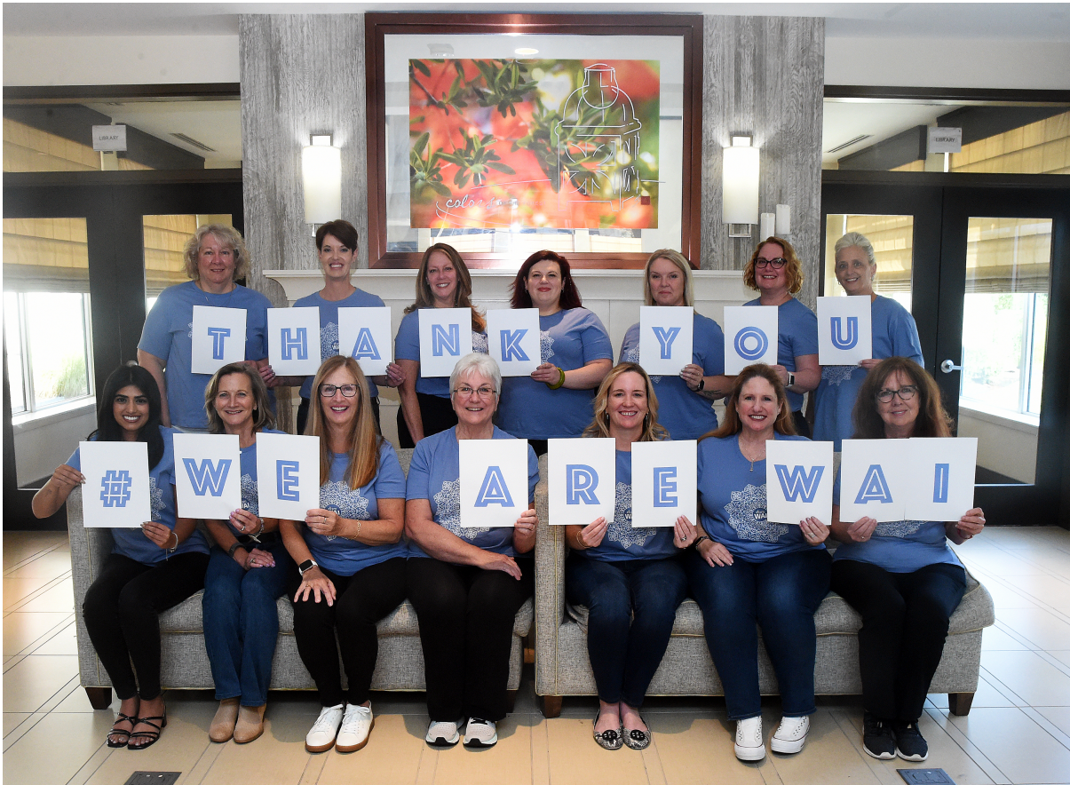
The WAI staff is thankful for the support of our amazing members, chapter network, as well as our industry partners and supporters around the world!