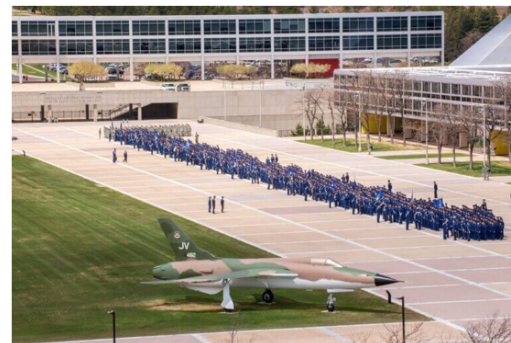
Located north of Colorado Springs, the U.S. Air Force Academy sits on 18,500 acres