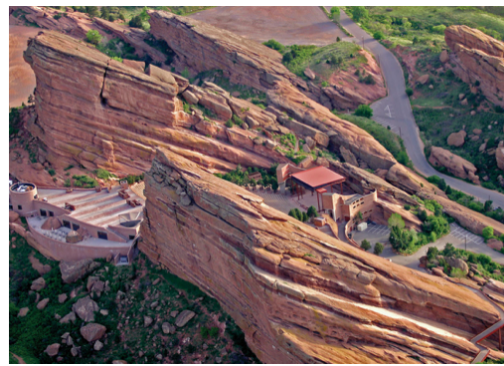
Enjoy the scenic drive during the Red Rocks Denver & Beyond Tour

The Wings Over the Rockies exhibits allow you to get up close and personal with historic aircraft, artifacts and memorabilia, and explore the future of aviation and aerospace. Attendees will also visit a Colorado Craft Brewery next door at the Lowry Beer Garden.