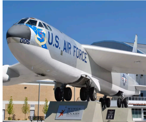
The Wings Over the Rockies Air and Space Museum Tour will feature historic aircraft and more

Located north of Colorado Springs, at the base of the Front Range, the campus sits on 18,500 acres of breathtaking mountain panoramas. Cadets will provide a guided tour starting at Arnold Hall and the Barry Goldwater Visitor Center--home to numerous engaging exhibits.