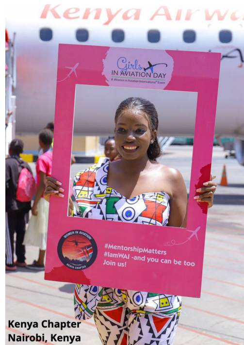
Kenya Chapter Nairobi, Kenya

Use the new Girls in Aviation Day Host Kit featuring examples of hands-on activities, permission forms, volunteer guidelines, activity kit orders, and much more. As a reminder, all GIAD merchandise and activity kits can be ordered through the WAI Chapter Store .