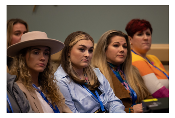
Be a part of WAI2024 in Orlando, and <u>submit your</u> <u>Education Session topic</u> by August 1, 2023.

time for questions and answers. For information on our past education sessions, or details on how to submit your proposed topic, visit <u>www.WAI.org/2024-call-for-</u> <u>presenters or email presenters@wai.org</u>.