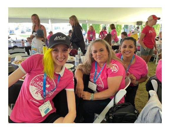
During the <u>WAI Connect Breakfast</u>, have fun meeting other WAI members and friends while enjoying a delicious breakfast. It's the perfect way to kick off WomenVenture at #OSH23 on Wednesday, July 26.

Advance tickets can be purchased online for $18 until July 21, and $20 at the WAI booth, Hangar B-2041. <u>Click here to purchase your</u> <u>ticket to the WAI Connect Breakfast!</u>