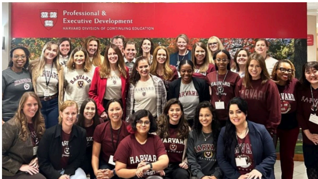
The 2024 Class of WAI/Harvard Women in Leadership: A Program for Emerging Leaders at the Harvard campus in Cambridge, Massachusetts

Meet the 30 WAI members who have been selected for the Women in Leadership: A Program for Emerging Leaders Class of 2025 , offered in partnership with Harvard University's Division of Continuing Education. This three-day program, May 13-15, 2025, at Harvard's campus in Cambridge, Massachusetts, will also include a follow-up virtual leadership coaching session in mid-June. Women from various countries, including Kenya, Slovakia, South Africa, UAE, the United Kingdom, and the United States, will have the opportunity to expand their own leadership roles through this professional development education program.