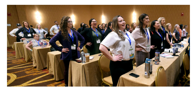
Visit Southern California February 23-25, 2023, to experience the <u>unique WAI2023 conference</u>, and learn why our theme is connect. engage. inspire.

Room blocks are filling fast. There are a variety of hotels at nearby locations to the Long Beach Convention and Entertainment Center. Take advantage of special conference pricing. Discounted rates will sell out. Visit WAI.org/2023-conference-hotels for details.