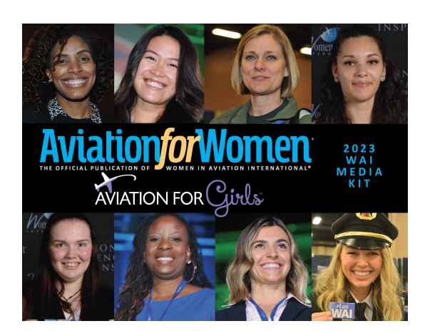
The <u>2023 Media Kit</u> is your guide to creating an advertising program that best fits your company's goals to support WAI's mission.

It's not merely a motto for WAI, it's a mindset. Connecting, engaging, and inspiring women as they venture into the diverse and exciting aviation/aerospace industry is our passion and purpose for existence. Consider an <u>advertising plan</u> for your company or organization next year by booking space in WAI's official publications Aviation for Women and Aviation for Girls magazines. There are various print and digital options to get your message out to our more than 16,000 members around the world.