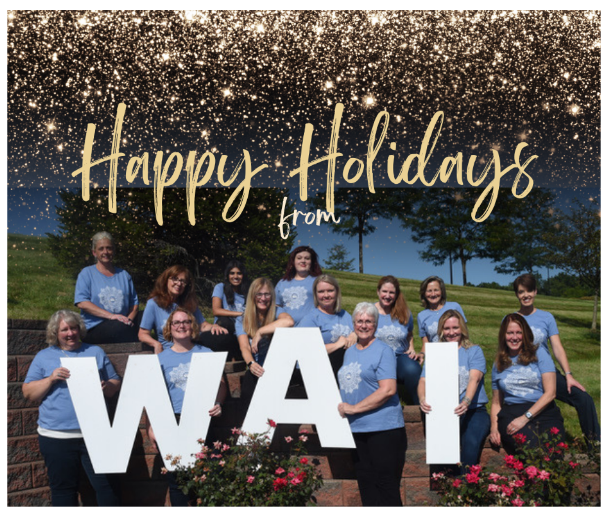
The WAI staff is grateful for the support of our more than 16,000 members around the world. Please stay safe and healthy during this 2022 holiday season, and enjoy this special time with family and friends.