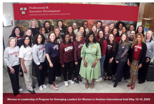
The Women in Leadership program for Emerging Leaders included 30 WAI members in the Class of 2025.

Harvard Women in Leadership 2027 scholarship applications will open June 1,