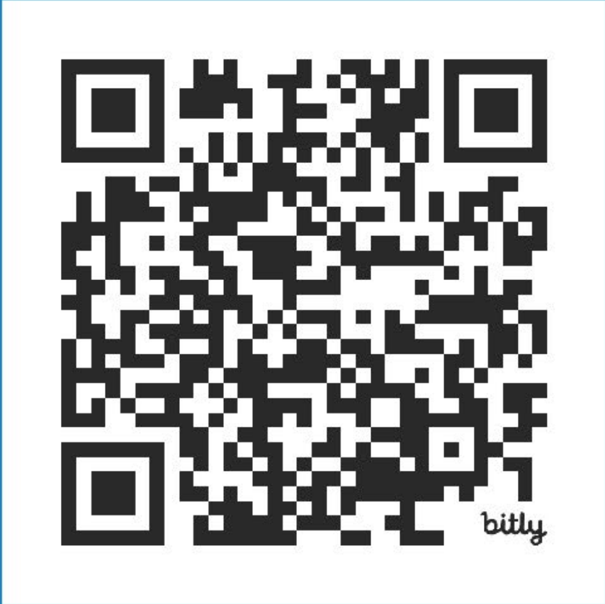
WAI Northern Colorado Chapter

Download the NEW Chapter Operations Module for additional tools to lead a WAI Chapter in your Community!