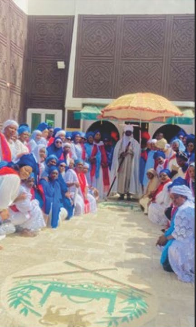
WAI Nigeria Chapter