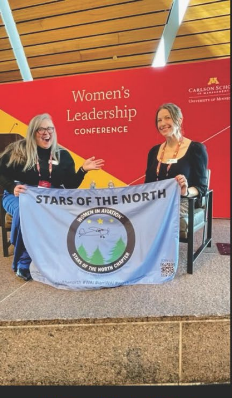
WAI Stars of the North Chapter