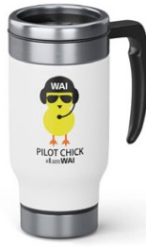
Travel Mug 14 oz. $18