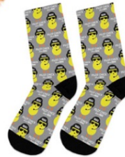
Socks One size fits all $18