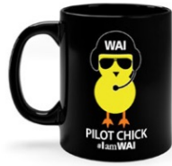
Ceramic Mug 11 oz. $20