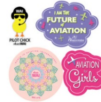
Assorted Glossy Stickers 4 stickers $10