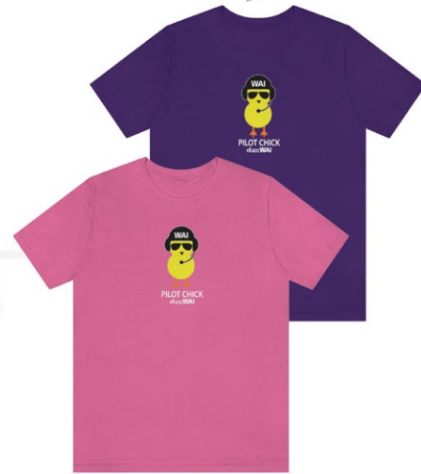
Cotton Tee Unisex sizes: S – 3XL $24