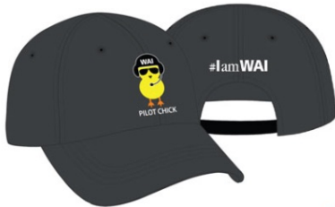
Charcoal Garment-Washed Cap $25