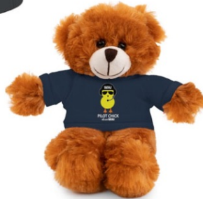
Teddy Bear with Navy Blue Tee 8-inch $24