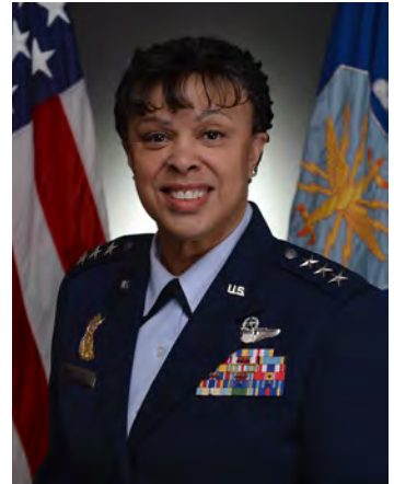
Lt. Gen. Stayce Harris

The Daily is a publication of Women in Aviation International, published during the annual conference.