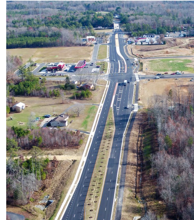
Route 639 (Ladysmith Road) Widening, Caroline County