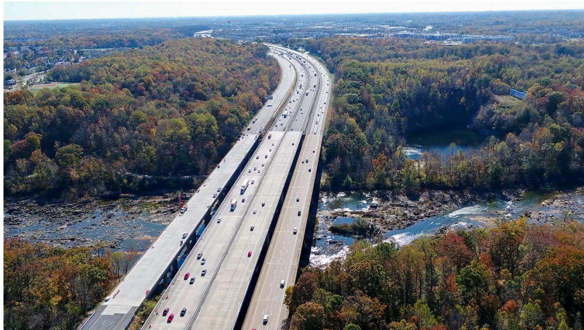
I-95 Northbound Rappahannock River Crossing, Stafford County and City of Fredericksburg