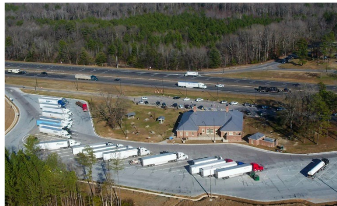
Truck Parking Expansion, I-95 Southbound Ladysmith Safety Rest Area