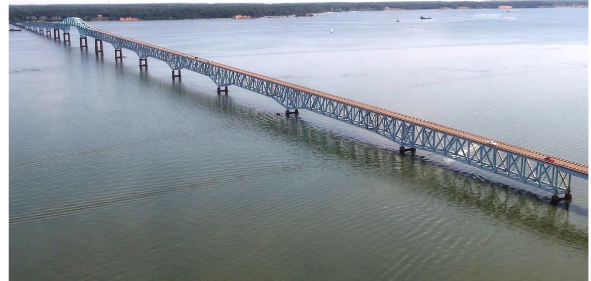
The Robert O. Norris Bridge carries Route 3 traffic over the Rappahannock River between Lancaster and Middlesex counties, linking the Northern Neck and Middle Peninsula