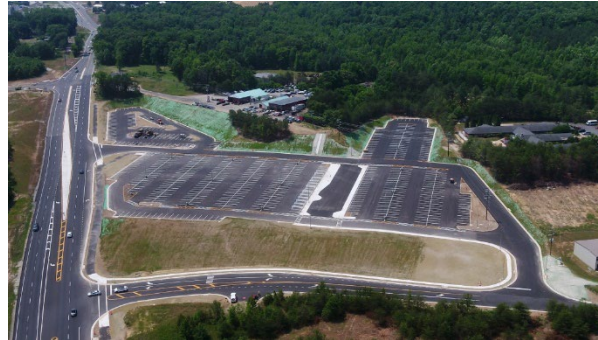
Route 1 and Commonwealth Drive Park and Ride, Spotsylvania County